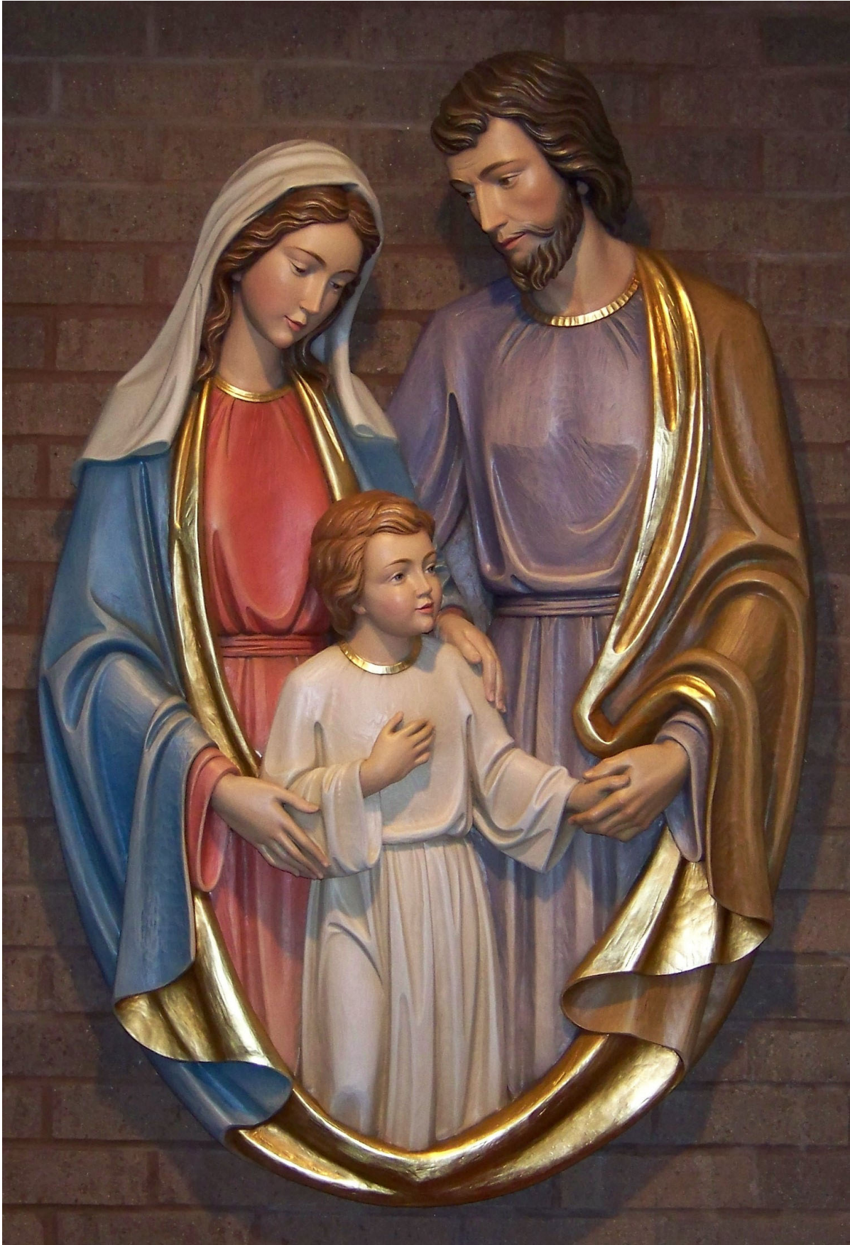
The Holy Family of Jesus, Mary, and Joseph