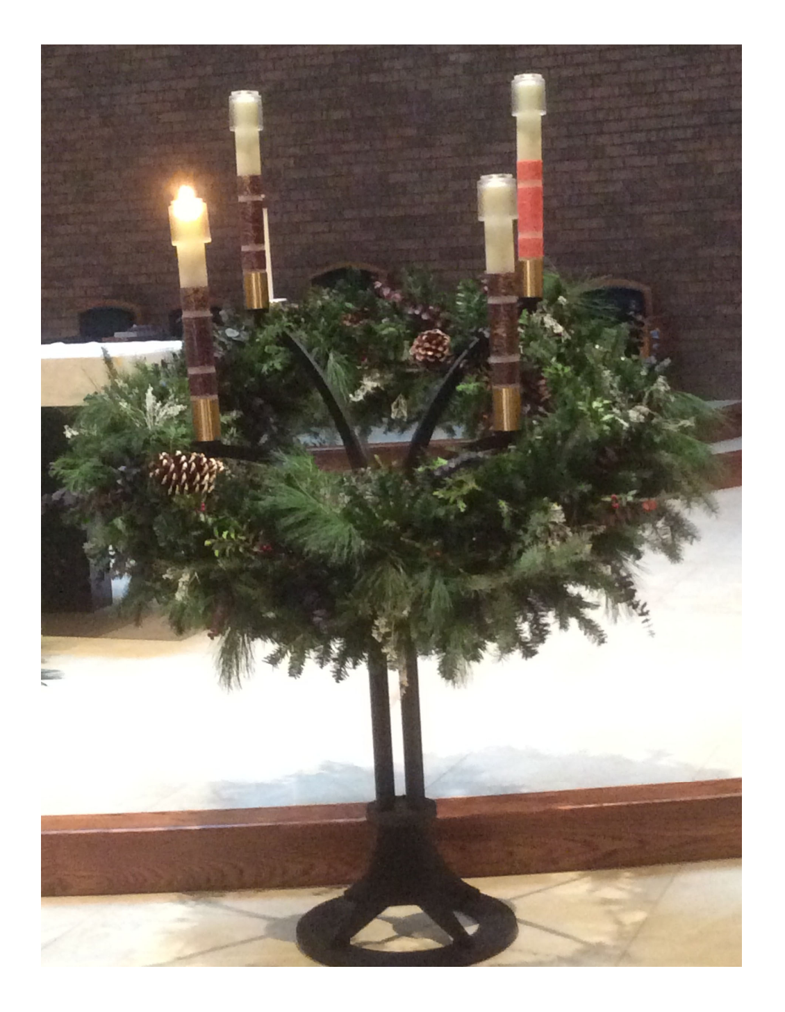
First Sunday of Advent