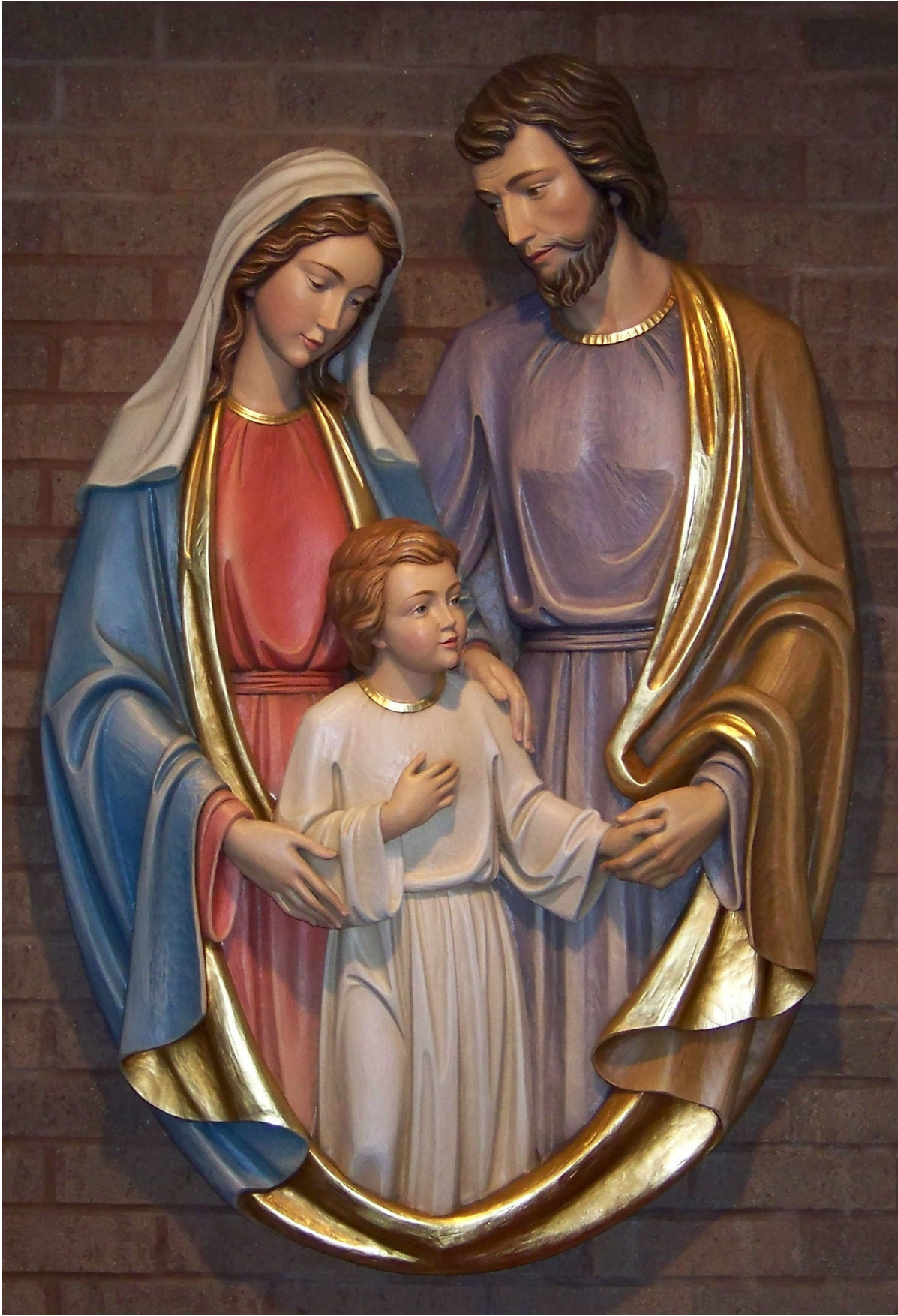
The Holy Family of Jesus, Mary, and Joseph