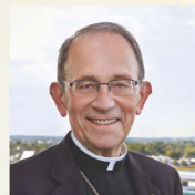
Mass with BISHOP LAWRENCE PERSICO

"BUT I HAVE PRAYED FOR YOU THAT YOUR FAITH MAY NOT FAIL. AND WHEN YOU HAVE TURNED BACK, STRENGTHEN YOUR BROTHERS." LUKE 22:32