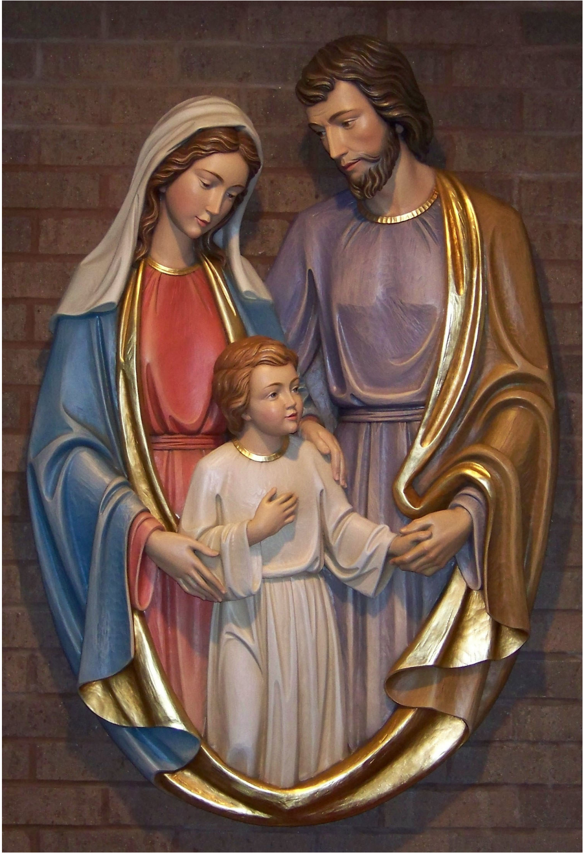
The Holy Family of Jesus, Mary, and Joseph