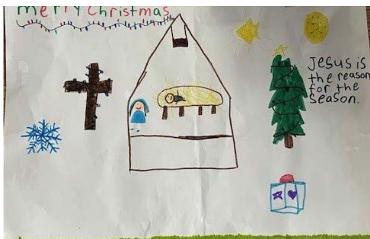
Raiden Baysingar—Grade 2

Thank you to all the participants for your wonderful artwork.