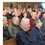
BE RENEWED IN CHRIST!