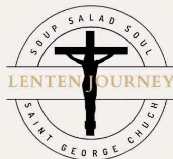
Holy Thursday 6:00PM SOUP, BREAD, & DESSERT 7:30PM HOLY THURSDAY MASS APRIL 2

OUR SPEAKERS WILL BE SHARING THEIR VOCATION STORIES, REFLECTING ON HOW THEY SERVE & SUPPORT THE LAY FAITHFUL, ADDRESSING THE NEEDS OF THE CHURCH TODAY, & SHARING THEIR VISIONS OF HOPE FOR THE FUTURE!