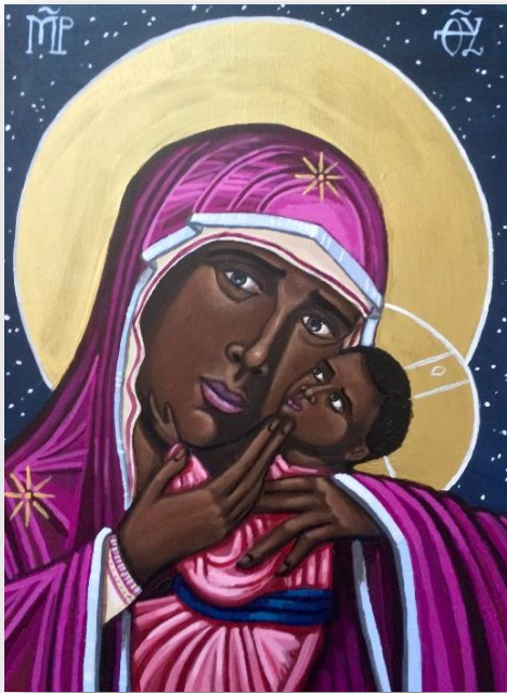
Image credit - Mother of God: Mother of the Streets by Kelly Latimore