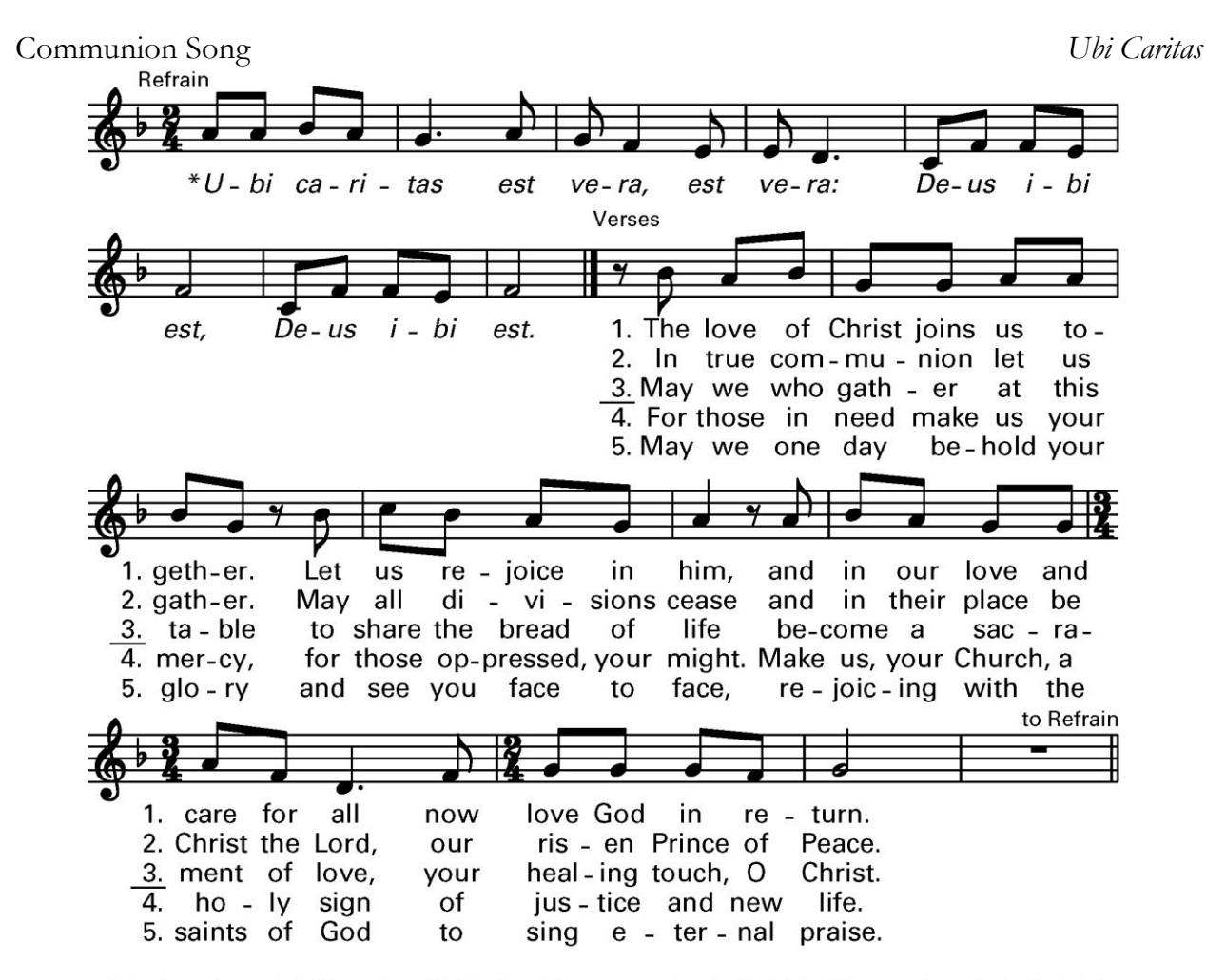
Refrain and vss. 1, 2, 5 based on Ubi Caritas , 9th cent.; vss. 3, 4 by Bob Hurd. Text and music © 1996, Bob Hurd. Published by OCP Publications. All rights reserved.